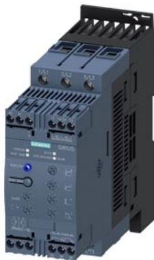
SIRIUS soft starter S2 72 A, 37 kW/400 V, 40 °C 200-480 V AC, 24 V AC/DC Screw terminals