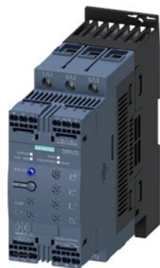
SIRIUS soft starter S2 63 A, 30 kW/400 V, 40 °C 200-480 V AC, 24 V AC/DC spring-type terminals Thermistor motor protection