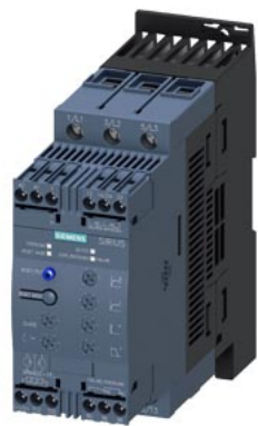
SIRIUS soft starter S2 63 A, 30 kW/400 V, 40 °C 200-480 V AC, 24 V AC/DC Screw terminals Thermistor motor protection