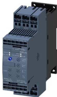
SIRIUS soft starter S0 32 A, 15 kW/400 V, 40 °C 200-480 V AC, 24 V AC/DC spring-type terminals Thermistor motor protection